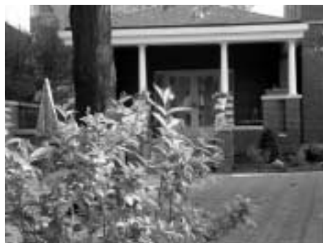
The gardens at Margaret Wagner Apartments