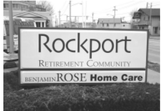
Benjamin Rose's Home Care Program expanded earlier this year with the opening of a west side office at Rockport.