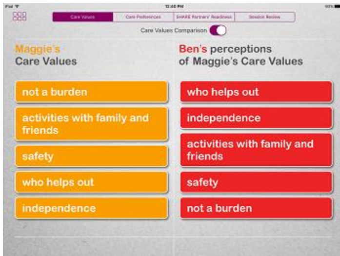
CAPTION: SHARE helps individuals with early-stage dementia and their care partners clearly communicate about care values (Click photo for higher res version)