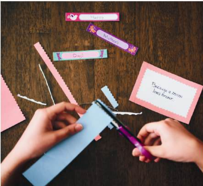
Happy Mothers Day